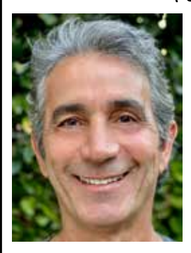
Let me help you find your way home