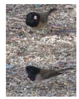
Fig. 4: The Oregon Junco is another common winter ground feeder near our homes. (BB)

use a variety of methods to navigate. Some of the known techniques include the earth's magnetism, polarized sunlight, star configuration and memory of landscapes. Songbirds, like the Golden-crowned Sparrow, migrate at night. They will fly up to three hundred miles each night. The altitude of their flight ranges between a few hundred feet and a few thousand feet above the land.