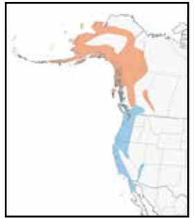
Fig. 2: The GCSP

These hardy sparrows winter in the far western states from Washington to Southern California. They arrive in our local mountains in September or October. They