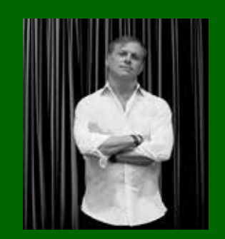
APPEARED ON: HEARTBREAK KID ME MYSELF & IRENE OSMOSIS JONES