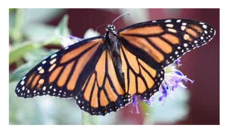
Fig. 1: This monarch butterfly adult may leave PMC to overwinter near the coast (MM).

Many of the wild plants, animals and fungi in our mountain natural areas have developed important relationships with each other. These relationships include predator/prey, parasite/host,