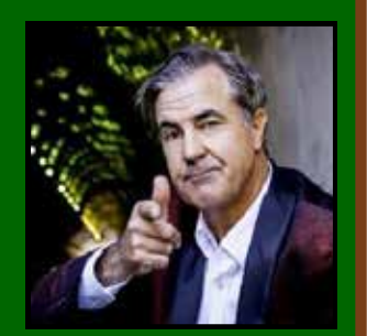
APPEARED ON: NETFLIX'S LOUDER MILK KINGPIN SOMETHING ABOUT MARY STUCK ON YOU THE THREE STOOGES

APRIL 25TH 7:30-9:00PM PMC CONDOR ROOM TICKETS: $20