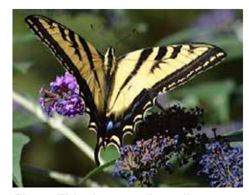
Fig. 5: This tiger swallowtail butterfly enjoys Buddleia flowers in a PMC garden (MM).

gion. And it was not named after an admiral, but rather because of its admirable appearance (Fig. 7). The caterpillars must have stinging nettle (or other members of