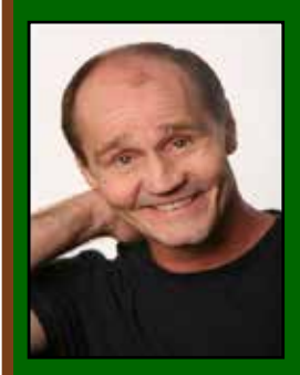
APPEARED ON: HBO & GOODFELLAS