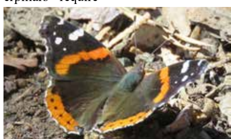
Fig. 7: Red Admirals often engage in mud-puddling to obtain nutrients (BB).