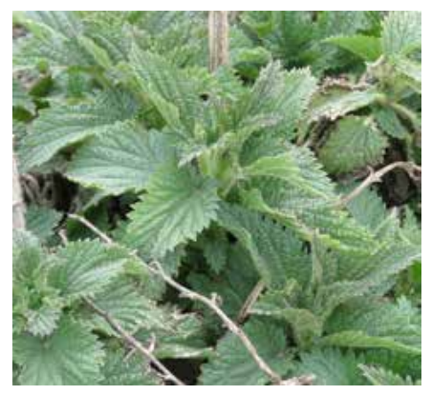
Fig. 8: Stinging nettle hosts Red Admiral caterpillars (BB).

oaks. In our region, canyon live oak is the host oak. Oak leaves provide the caterpillars with not only food, but enough toxin