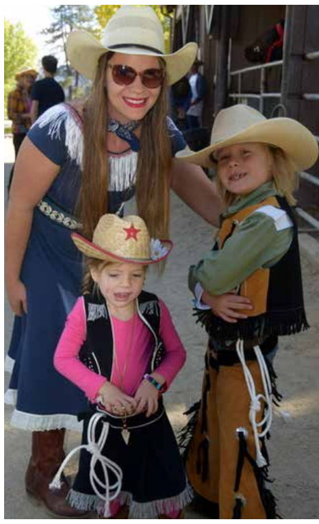
These cowgirls wrangled up a fun time at the Barn Bash.