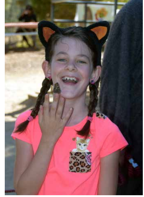
This little kitty cat was all smiles at the Barn Bash.

Our barn doors are open daily from 9 a.m. to 4 p.m. Stop by to meet and greet our amazing equestrian team, our horses and their owners.